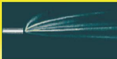
Without PROKOTE FT