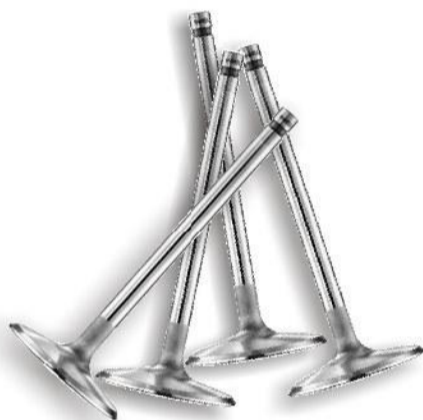
PROKOTE FT MAXIMIZER will not only keep components of your fuel system protected, but its regular use will maintain them free of clogs and impurities... and lubricated for optimum performance and efficiency